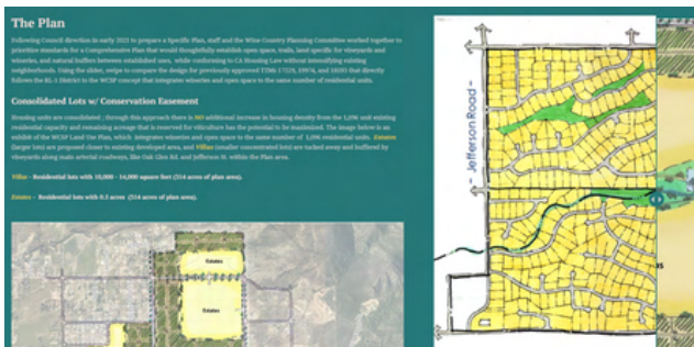
The StoryMap interface offers a slider comparison tool, where residents were able to easily compare the development outcomes under the existing General Plan vs. the proposed Wine Country Specific Plan.

One such tool is StoryMaps, which has been used for their Wine Country Specific Plan and Freeway Corridor Specific Plan Update to highlight their project history, integrate surveys, and embed media and interactive content.