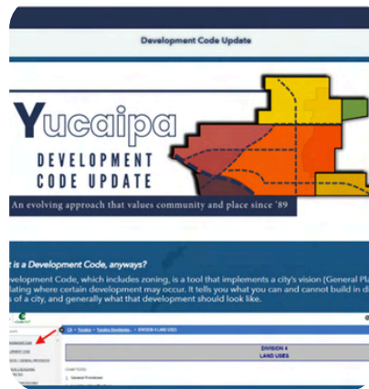
With REAP 2.0 funding support for the city's Development Code Update, Yucaipa created a HUB Site to document the life cycle of this planning project, making updates and adding resources as the project progresses.

With the launch of their new "Yucaipa Permit Exchange" online permitting portal last summer, the team creatively used ArcGIS tools to create interactive How-To User Guides to support people doing business in the city to get better acclimated to the new digital system. Compared to standard PDFs, these resources can be easily maintained into the future. Rather than having to worry about rehosting updated documents, these user guides can be quickly edited online and with just a few clicks, the original published link will be refreshed with updates.