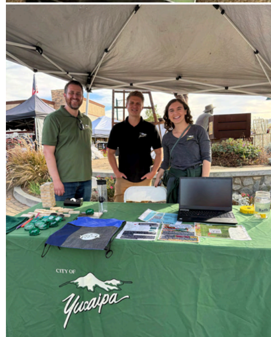
The Yucaipa team attended a WinterFest community festival to connect with residents and get feedback for on-going long-range planning projects. QR Codes were available on informational brochures that linked to the Specific Plan StoryMap resources, the Development Code Hubsite, and Community Surveys which were created using Survey123.